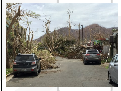
Puerto Rico- Devastation