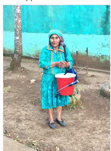
Honduras- Woman with Water Filter Supplies